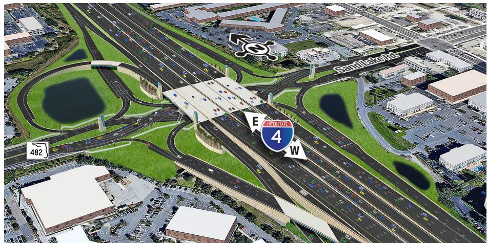
The design for this project is ongoing. The final configuration of the interchange will be similar to what is shown in this rendering, but small refinements are anticipated.

Implementing the Sand Lake Road DDI during the project's construction phase gives crews space to work in the median of Sand Lake Road. Crews need this room to reconstruct the I-4 general use lanes and extend I-4 Express – the two tolled managed lanes in each direction in the center of I-4 – over Sand Lake Road.