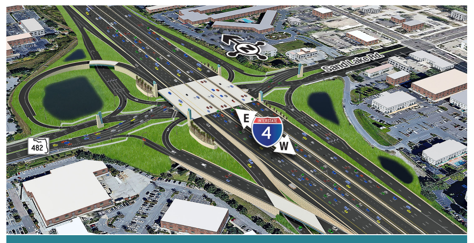
The design for this project is ongoing. The final configuration of the interchange will be similar to what is shown in this rendering, but small refinements are anticipated.

Implementing the Sand Lake Road DDI during the project's construction phase will give crews space to work in the median of Sand Lake Road. Crews need this room to reconstruct the I-4 general use lanes and extend I-4 Express — the two tolled managed lanes in each direction in the center of I-4 — over Sand Lake Road.