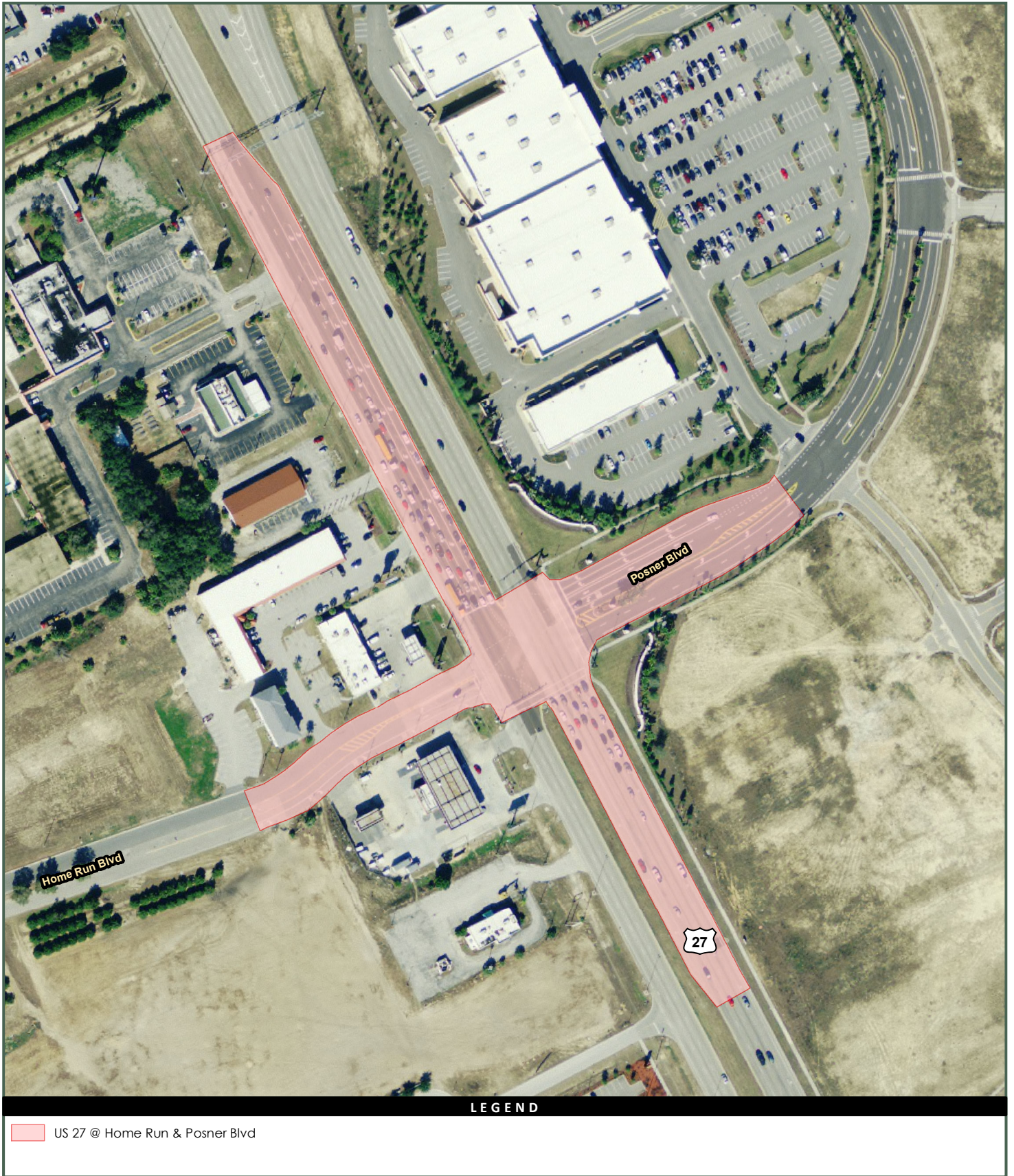
Figure 2- Intersection Map